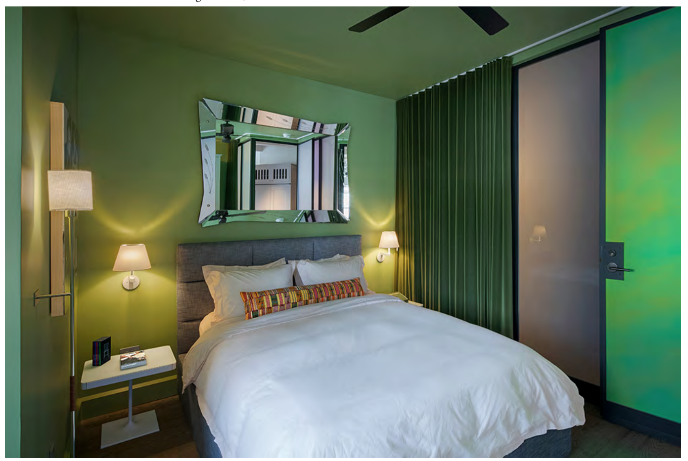
The main bedroom is a medley of greens with a bed from Restoration Hardware and side tables from Design Within Reach. The accent pillow is covered in vintage African textiles from Paula Rubenstein. The sconces are from Artemide, and mirror from cityFoundry.