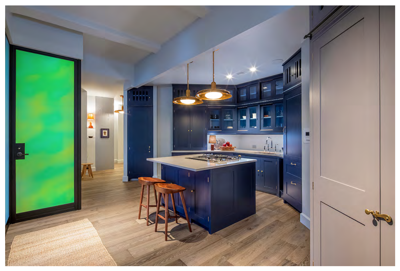
The kitchen cupboards are from Plain English with a custom cutting board by DBO Home, found at Field+Supply. The hanging lights are from RW Guild.